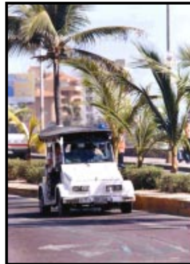
One of the fiberglass kit cars that we saw on our trip.

Next we had 2 days at sea. These were the days to relax. Some of us found a nice quiet spot to read. Others found a not so quiet spot by the pool to relax and enjoy people watching. Yours truly found an upper deck to enjoy the poolside music and crocheted the day away. There were Enrichment series talks to benefit all. There were a mass of different Trivia games from 'Seinfeld' to 'I Love Lucy' to the 'Battle of the Sexes' (the women won!). And of course you could play bingo almost every day. There were art auctions, volleyball games, shuffleboard, and even dance classes. Since we were at sea all day, there were opportunities to eat breakfast beginning at 7:00 am, lunch at 12 noon, and dinner at 6 or 8:30 pm. But don't get discouraged, you could also eat at the buffet 6:30 am-7 pm. But wait, there also was Late Night Gourmet Bites for those that just needed a bit MORE to eat.