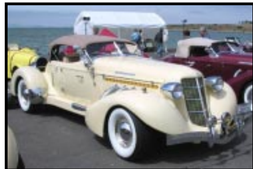
Charley Spear's Auburn Speedster