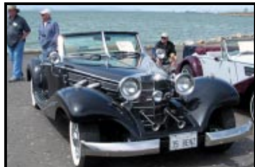
Tom Wallters' Mercedes 500K