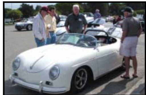
Carl Clark's 2.1 liter Speedster