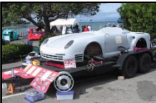
Jerry Poca's Porsche 959 kit