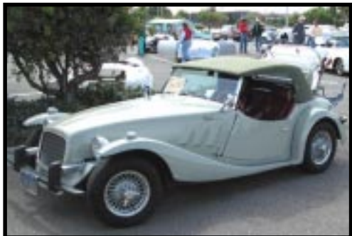
Gerg Hampton's Blakely Bearcat