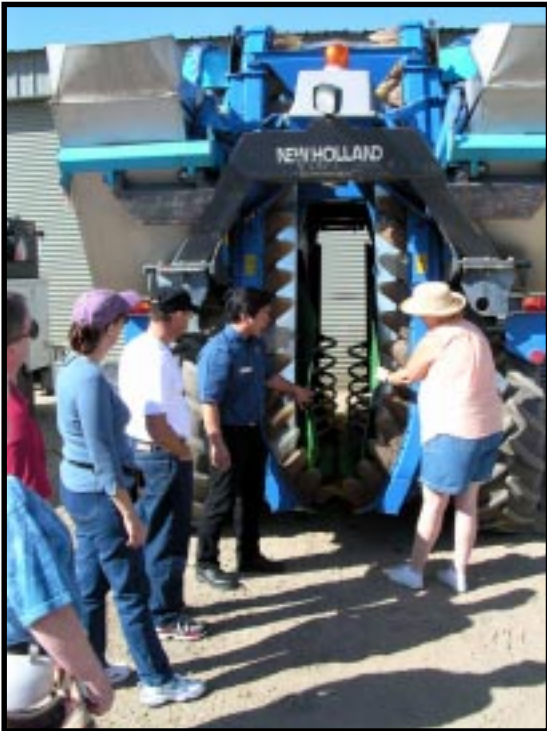
Above: Wente's giant harvesting machine that straddles the row of grapevines and "some-how" picks the grapes.