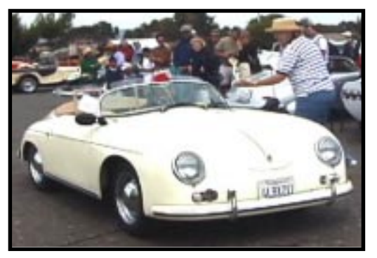
1st Chuck Honodel - Porsche