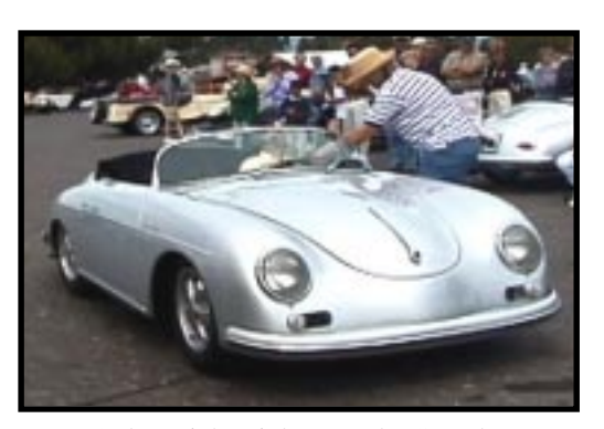
3rd Partick Friel - Porsche Speedster