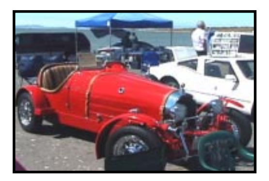
2nd Pat Cooley - Bugatti