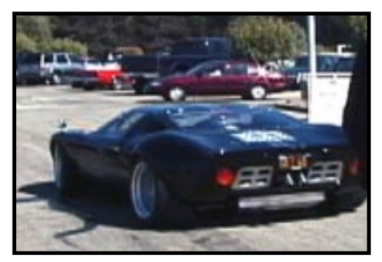
3rd Farhad Faily GT-40