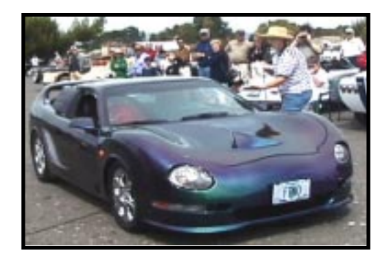
1st Al Bohr - Fino