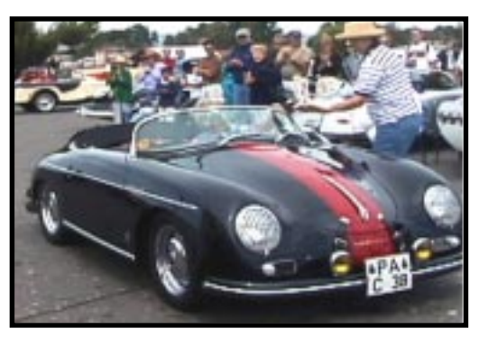
2nd Paul Harford - Porsche