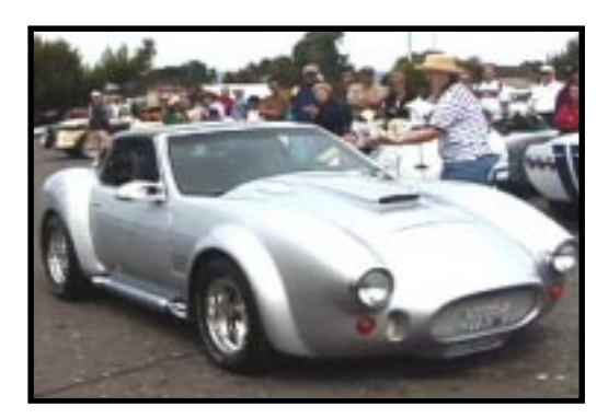
2nd Dee Farris - Tomahawk