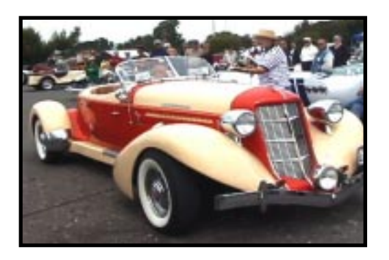
2nd Don Campbell - Auburn Speedster