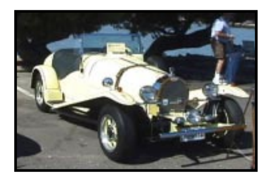
1st Dick Lager - Bugatti