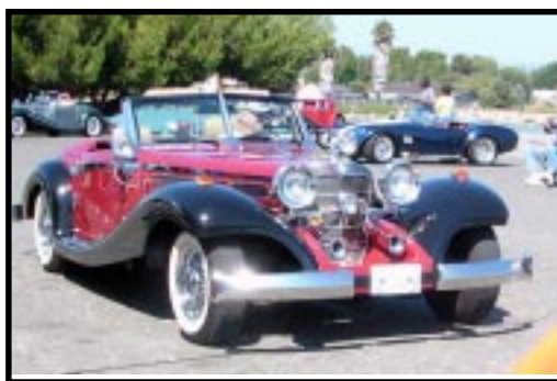
3rd Chuck Maddux - Mercedes 500K