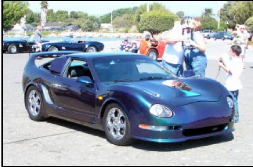
BEST OF SHOW A. H. A. SPECIAL AWARD Al Bohr - Fino