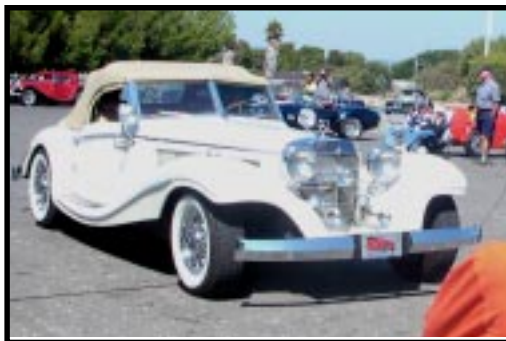
2nd Vern Hance - Mercedes 500K