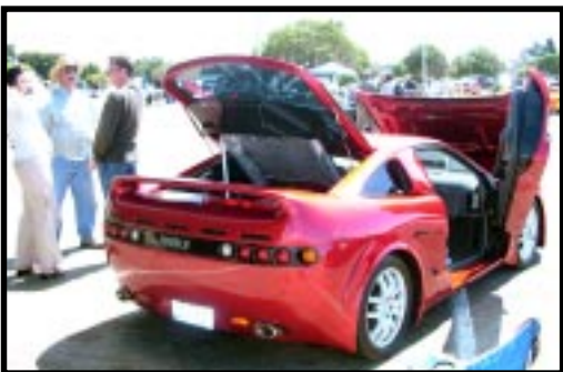
3rd Alan Phillips - Finale