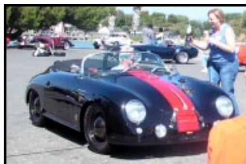
3rd Paul Harford - Porsche Speedster