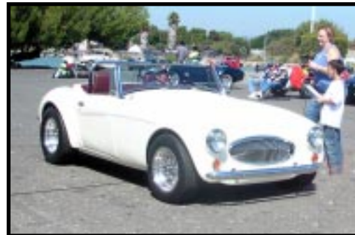
2nd Jim Vermace - Sebring MX