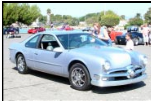
1st Gil Somerhalder - 1950 Ford