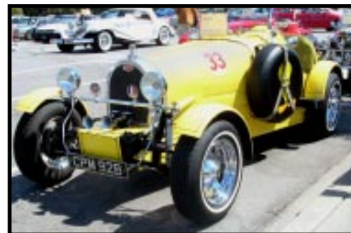
2nd Tom Lugone - Bugatti T-27