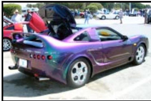
2nd Al Bohr - Fino