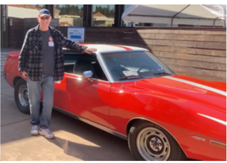
What's a Blackhawk Show without some car stories told around the base of the big elephant.